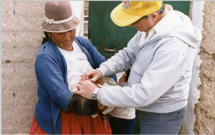
A volunteer immunizes a child against polio in Bolivia. 1989. The WHO's America region is certified polio-free in 1994.

PolioPlus supports the commitment Rotary made a few years earlier to "eliminate polio through immunization." Today, that commitment remains a top priority and the PolioPlus program coordinates the efforts of Rotary and its partners.