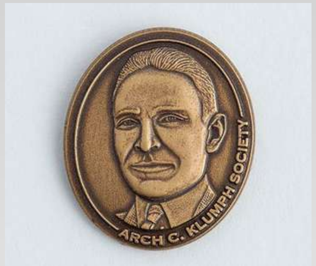
Arch Klumph Society lapel pin

Rotary creates the Arch Klumph Society to recognize individuals, couples, and organizations that have contributed $250,000 or more to the Foundation. The first annual dinner is held at the 2005 convention in Chicago.