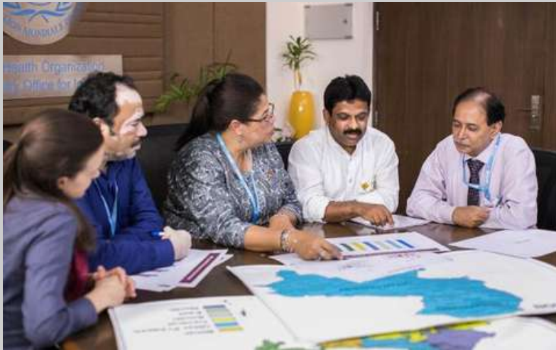
Ending polio requires close coordination with our partners. A Rotary member from India meets with members of the WHO India National Polio Surveillance Project at the WHO country office in New Delhi, India, in 2019.

Inspired by Rotary's immunization work in the Philippines and global fundraising success, the World Health Assembly sets a goal of worldwide polio eradication. Rotary is a founding member of the Global Polio Eradication Initiative (GPEI).