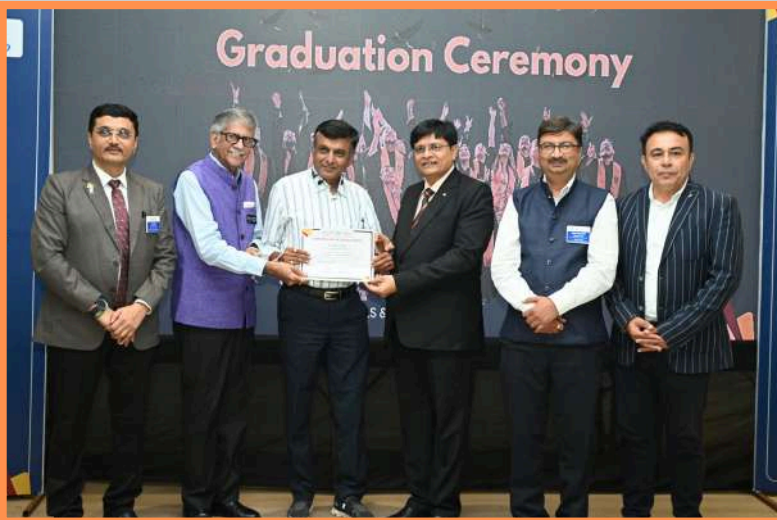
Club Members during Dist. Training of DLLS-AGLS 2026-27