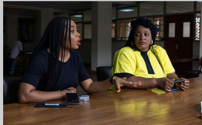
Rotary Peace Fellows at Makerere University in Kampala, Uganda, in 2022.

Foundation Trustees approve the creation of the Rotary Centers for International Studies in peace and conflict resolution , now known as Peace Centers. An inaugural class of Rotary Peace Fellows begins studies in 2002.