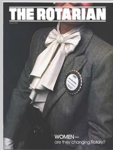
About a year after women join Rotary worldwide, The Rotarian magazine runs a feature story looking at the impact of Rotary's expanded membership.

Women join Rotary clubs throughout the U.S. following a decision by the U.S. Supreme Court. In 1989, women join clubs worldwide.