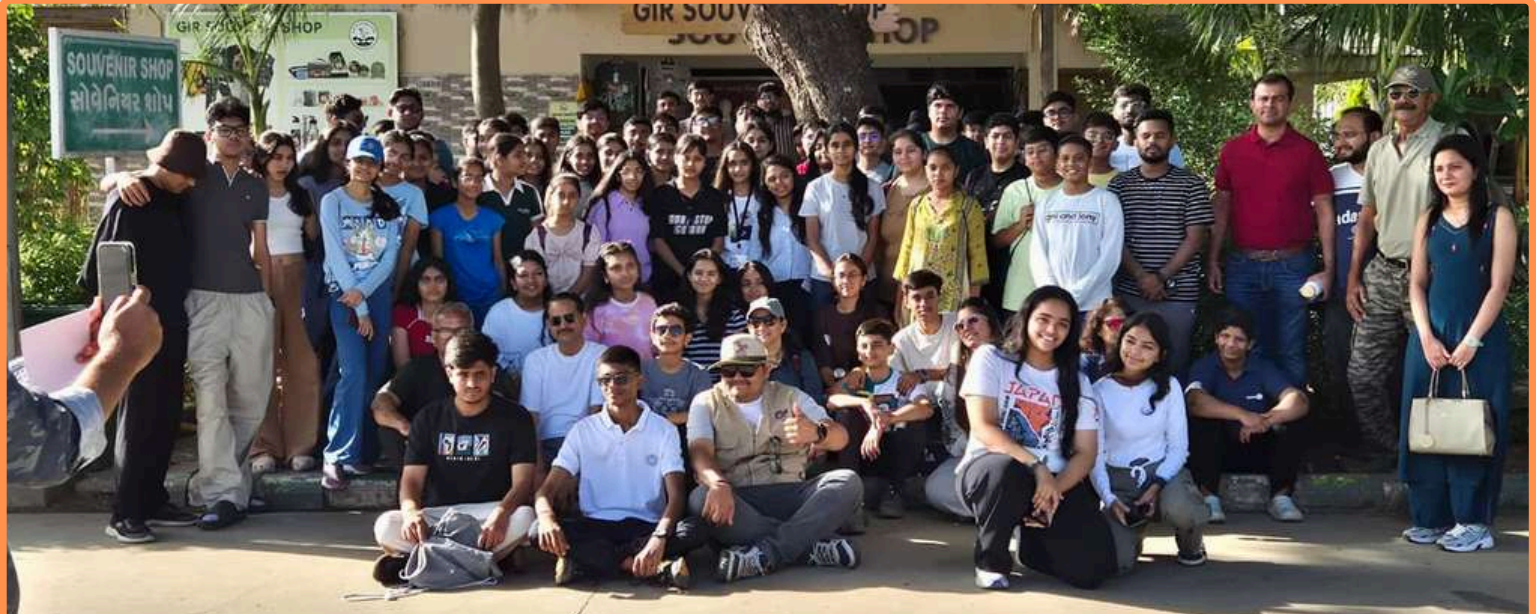
Club Children Participation in National RYLA @ Sasan Gir